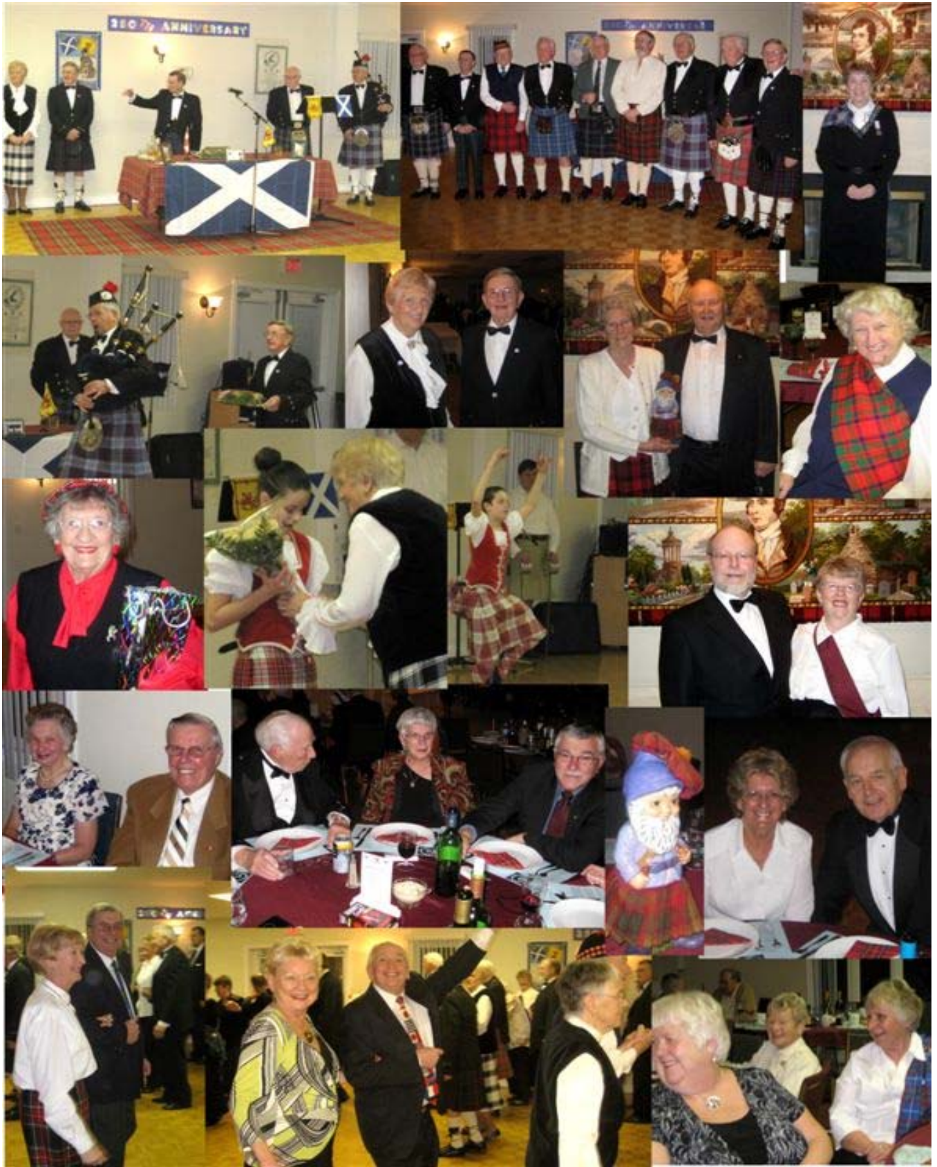
Whoever knew there were his many scots in BBTB!