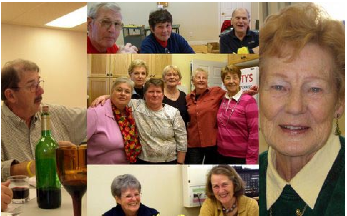
CHILI LUNCH CROWD